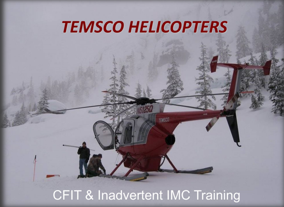
CFIT & Inadvertent IMC Training